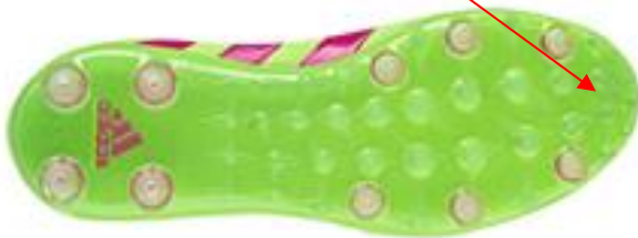
Soccer Cleat (No Toe Cleat)