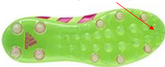
Soccer Cleat (No Toe Cleat)